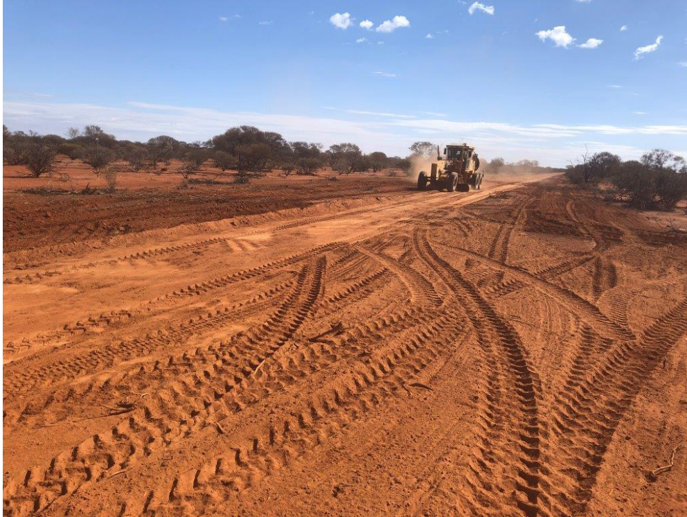
Clearing and Grading July 2020

The clearing and grading of the 285 km fence alignment has been completed and a tender for construction of 120 km of fencing has been awarded to Yalgoo based fencing contractor Andrew McSporran. The tender for the remaining 55 km section has been advertised with a closing date of 27 November.