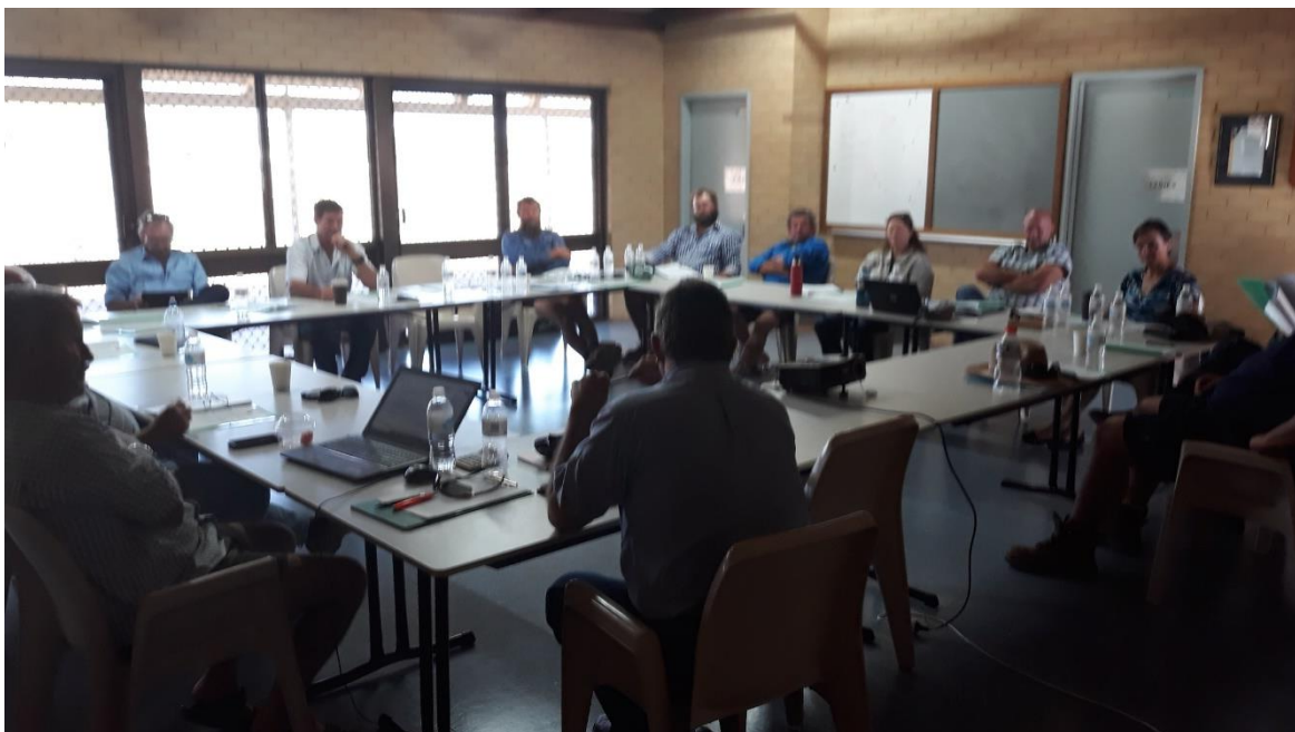
Committee Meeting - Meekatharra Sports Complex

The minutes of the AGM and Committee meeting held on 13 October are an attachment along with this newsletter.