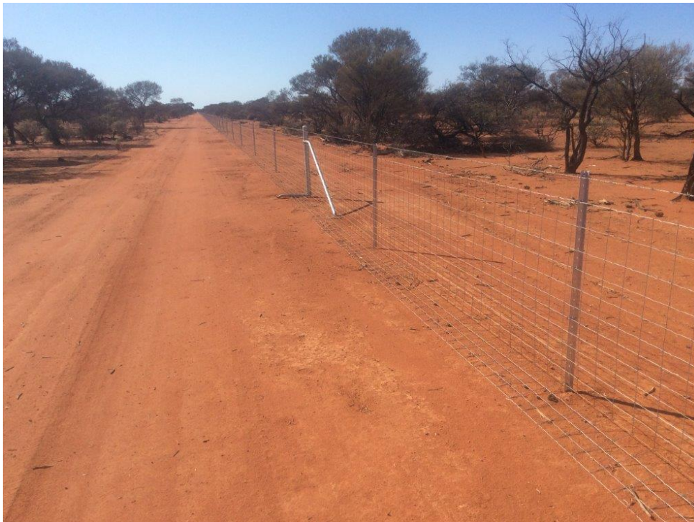
Completed Vermin Fence September 2020