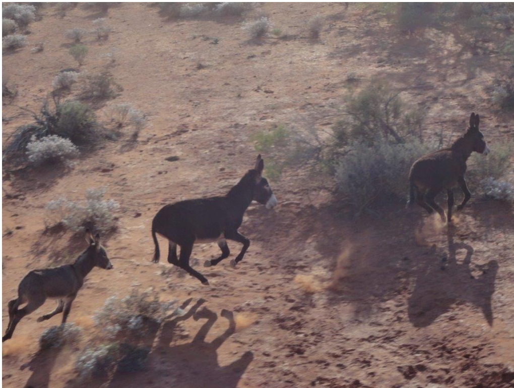
View from the Helicopter Flying Low

A follow up two-day cull is planned later this year for Three Rivers, Bryah and Mingah Springs.