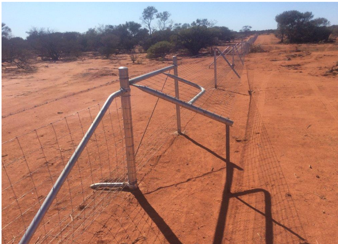
New Construction – Light Flip up to accommodate flooding

At the Committee Meeting on 16 February it was recognised that a long-term solution is required to the control of wild dogs on government managed lands. This is of particular importance now that the Murchison Region Vermin Cell is nearing completion. The long-term solution, that will be put to both the Minister for Primary Industries and Minister for Environment, is the construction of vermin fencing to enclose government managed lands and thus prevent the movement of wild dogs onto adjoining pastoral leases. One of the advantages this proposal has it that existing vermin cell fencing could be utilised as part of the enclosure. A further advantage is that fencing would enable the Department of Biodiversity and Attractions to better manage wild dog numbers on their lands without adversely impacting their pastoralist neighbours.