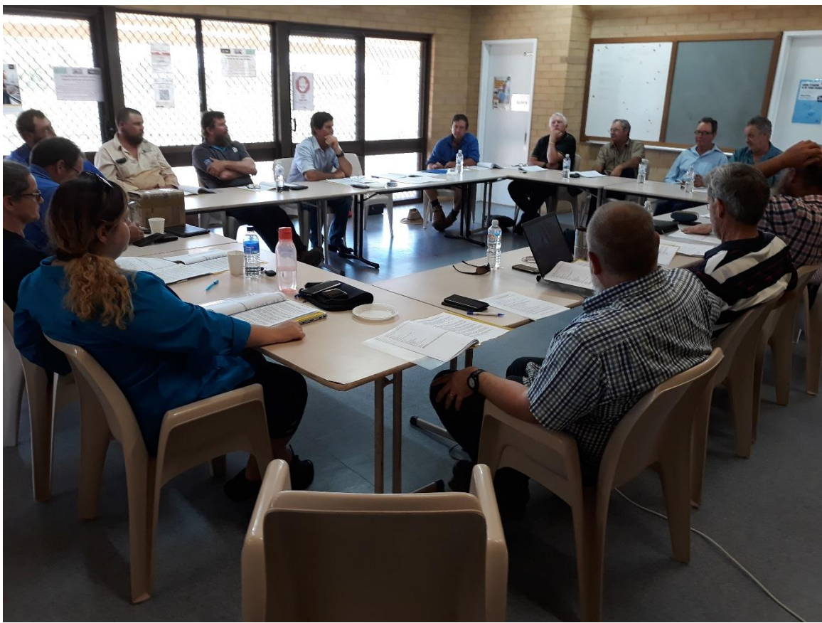
Committee Meeting 16 February 2021

Management Committee members are elected on a rolling basis for a term of three years.